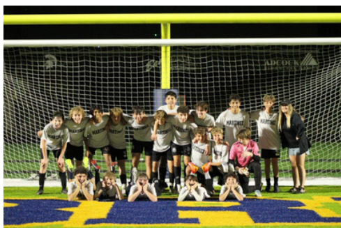
Boys Soccer Team

Project: Considering alternative and innovative ways to irrigate during droughts.