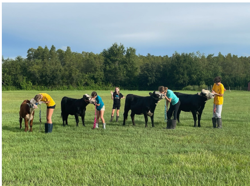
The Beef Team in Action